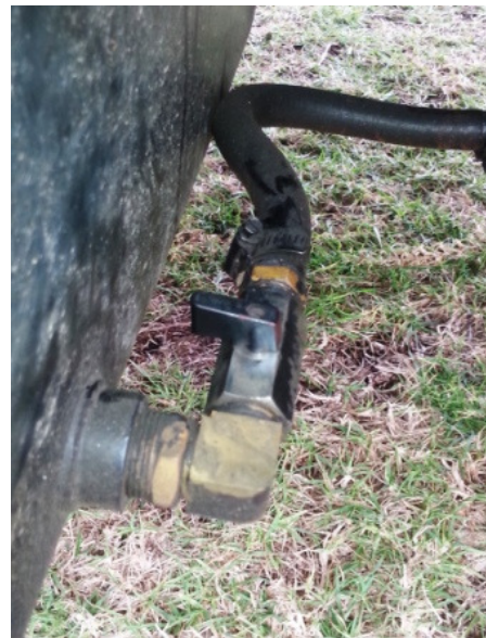
Stop Cock in "Closed" position for refuelling only.