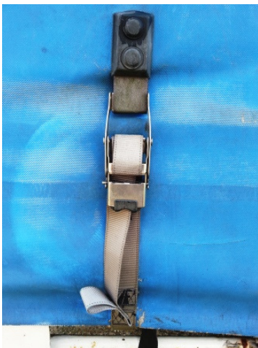
Incorrect strap position