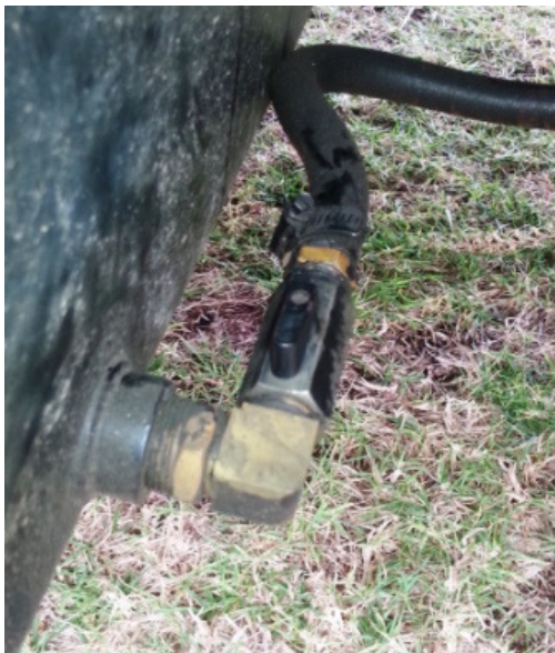
Stop Cock in "Open" position