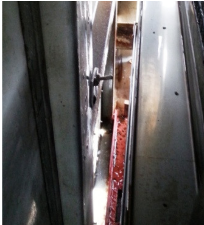
Light switch at back of truck to the left of back door.