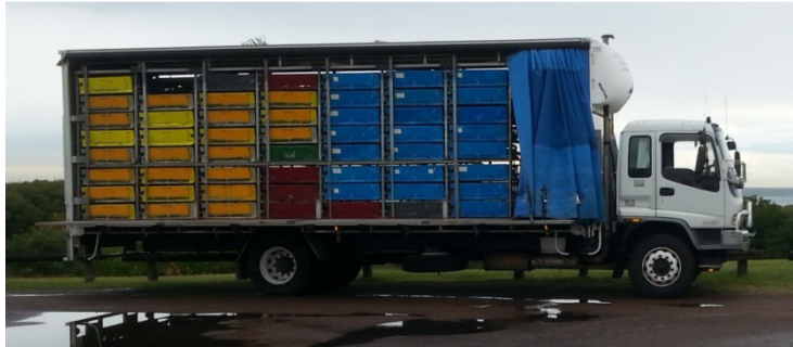
Truck curtains pulled to front ready for liberation